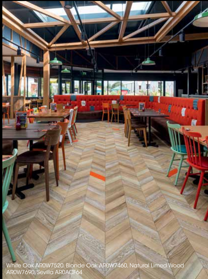
White Oak AR0W7520, Blonde Oak AR0W7460, Natural Limed Wood AR0W7690, Sevilla AR0ACF64

Find out more about our range of products and look at our case studies for more inspiration.