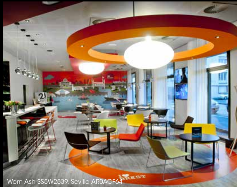
Worn Ash SS5W2539, Sevilla AR0ACF64