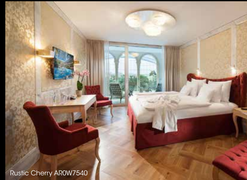
Rustic Cherry AR0W7540