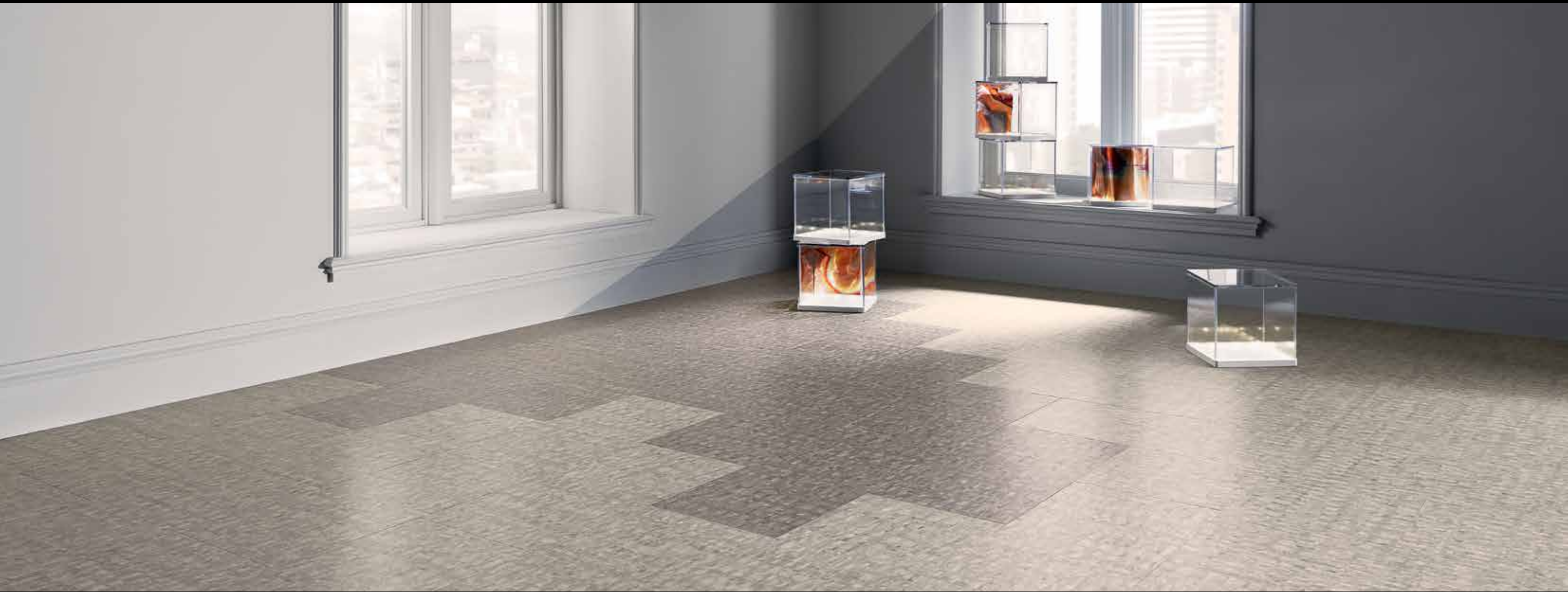
Alchemy Atmosphere AR0AAL30, Alchemy Haze AR0AAL14

Our flagship collection of 188 products, offers the flexibility to create bespoke designs, or cut and combine tiles in an infinite numbers of ways.