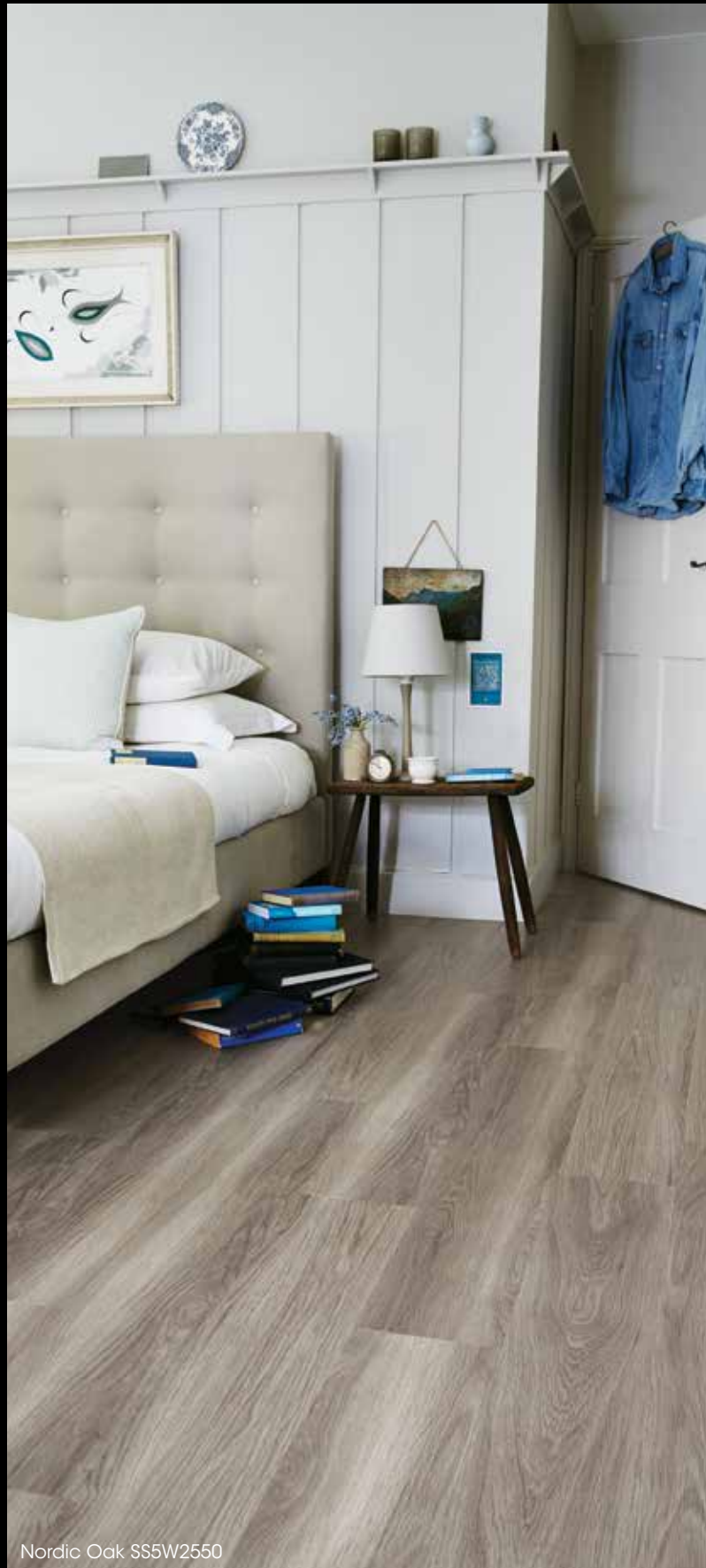
Nordic Oak SS5W2550