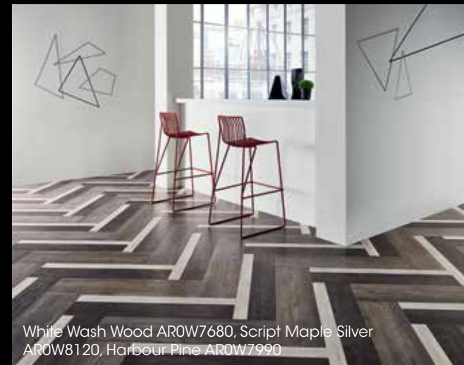
White Wash Wood AR0W7680, Script Maple Silver AR0W8120, Harbour Pine AR0W7990