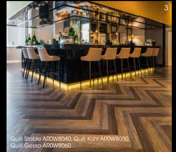
Quill Stable AR0W8040, Quill Kohl AR0W8050, Quill Gesso AR0W8060