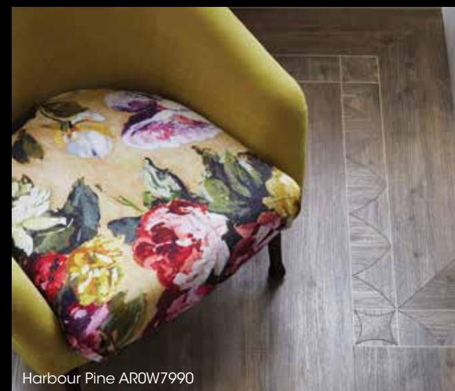
Harbour Pine AR0W7990