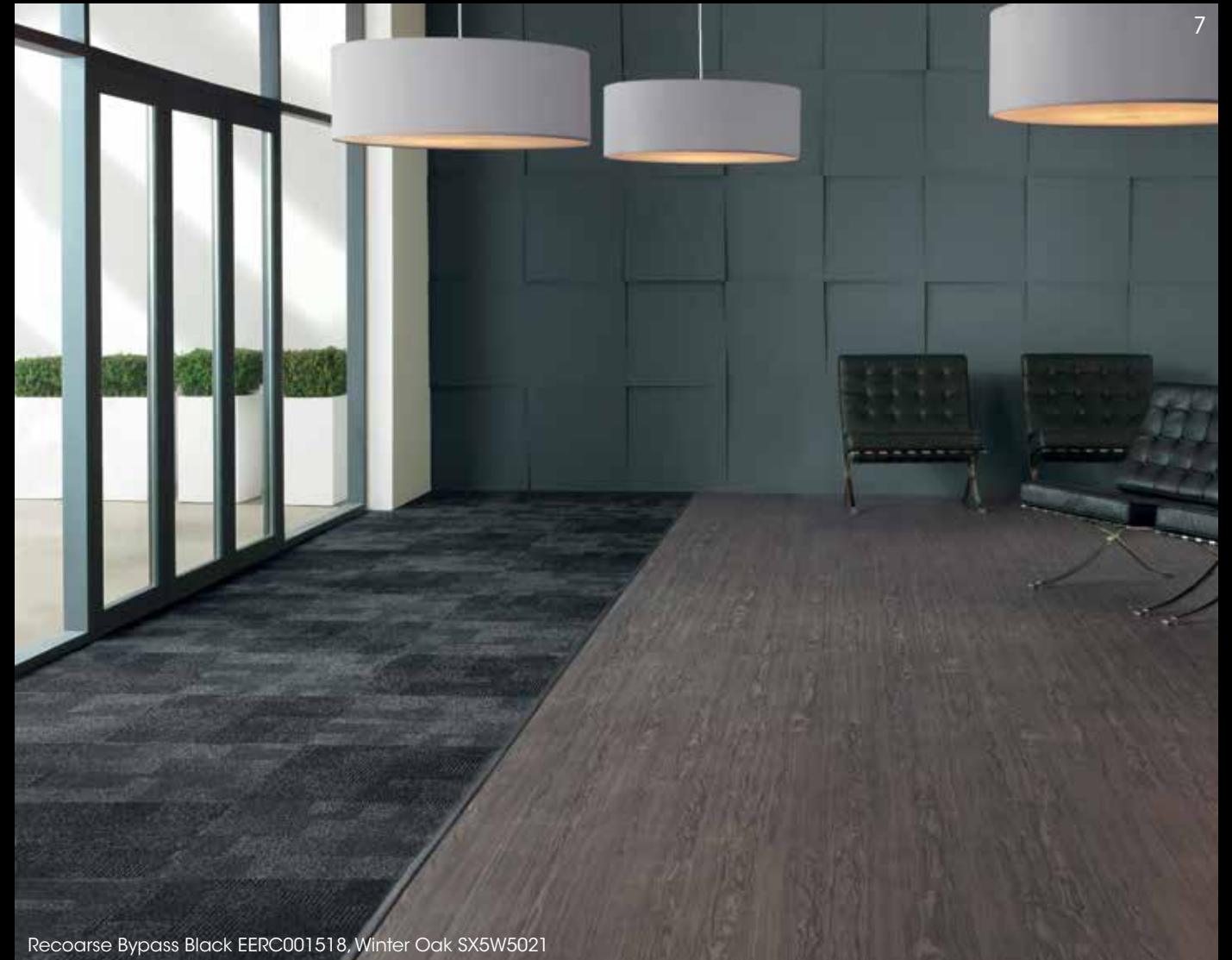
Recoarse Bypass Black EERC001518, Winter Oak SX5W5021