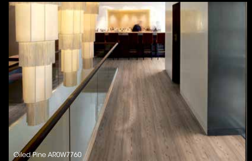
Oiled Pine AR0W7760